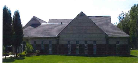
Huber Heights Courthouse